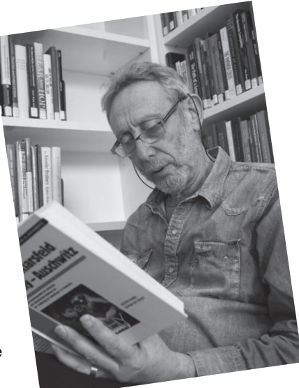
At the Wiener Library in 2018

This first-hand account of his search includes personal reflection, letters and documents and is interspersed with poems that express his feelings and capture the "pictures in his mind".